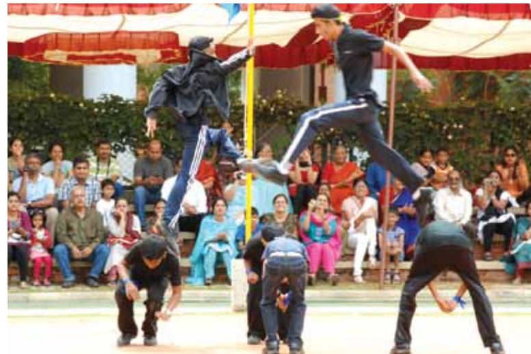
A dramatic aerobics display.