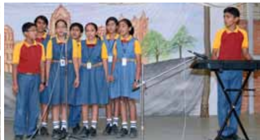
Students performing in the Intramural Cultural and Literary Fest.