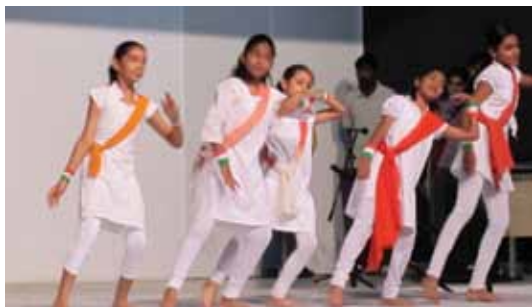
Desh Rangeela dance.

The Annual Sports Day was made even more exciting by the joint participation of The Brigade School @ Mahadevapura! Students took part enthusiastically in all competitions and many prizes were won. The tiny tots of