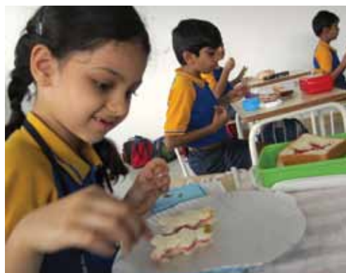
Integration activity: Gingerbread Man.

Celebrated on 4 November, Mindspace Activity Day showcased projects done by the students to the parents. Enthusiastic children confidently answered questions. Pre-primary children displayed their skill at using Montessori materials and spelling formidable words using the techniques of phonics. Parents were pleasantly surprised to see how much the little ones knew!