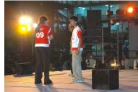
High School students enact a contemporary play