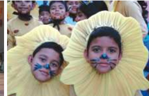
Students stand dressed and ready to perform!