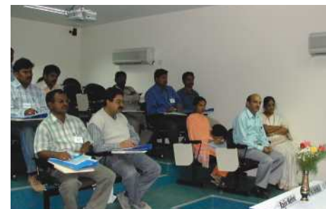
An induction class in progress at the institute

Regular workshops/programmes will be conducted by Brigade-CTVTI from now on. For details visit the website at brigade-ctvti.org or contact Mrs Suman Wagh at +91-80-2297 3525