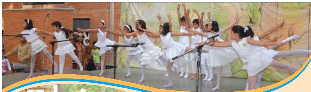
Ballet performance by Primary students