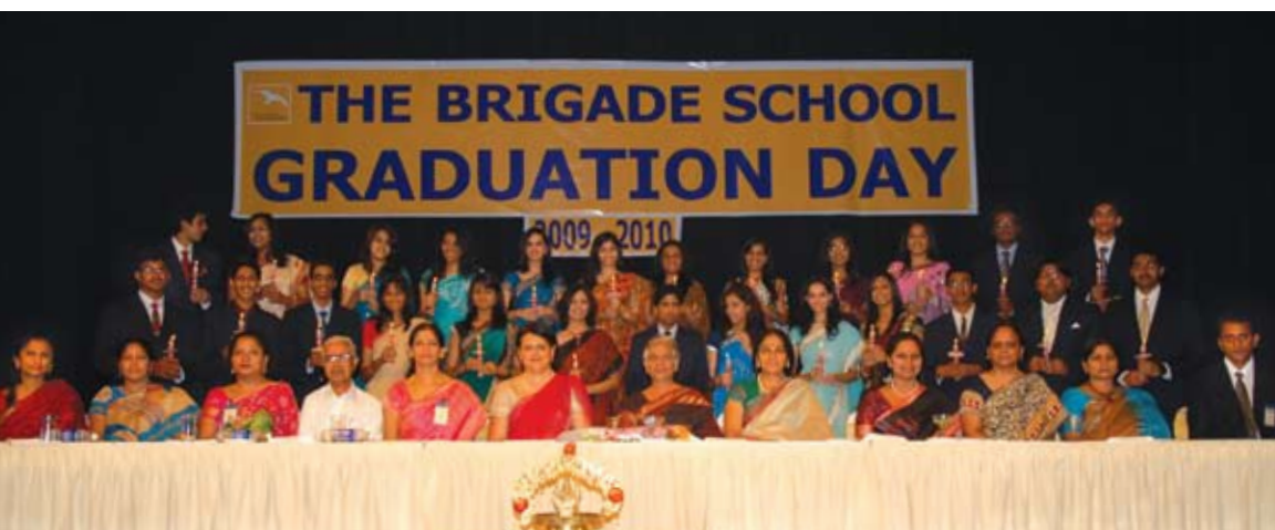
Graduation: Std 12

Three co-educational schools. Three locations. One approach and vision.