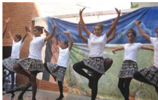
Scottish Highland Dance

variety of dances, from the Scottish Highland Dance to the Morris Dance to Rock and Roll. The students of Std 6 enacted The Tragedy of Macbeth , by William Shakespeare, with young dramatists performing like thespians; giving the very appreciative audience a taste of what it must have been like to have attended a show at the Globe Theatre of yore!