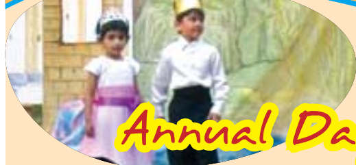
Pre-primary Annual Day