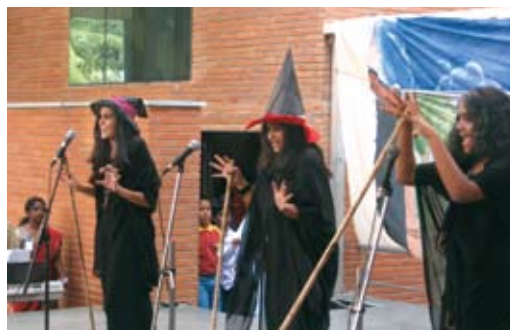
A scene from Macbeth