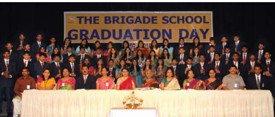
Graduation: Std 10